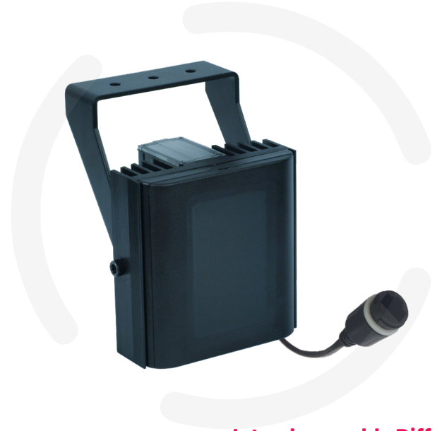
Interchangeable Diffuser Lens